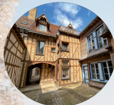
AR - Troyes La Champagne