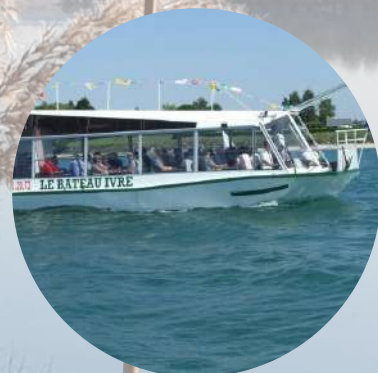
Le bateau ivre / Mesnil St Père