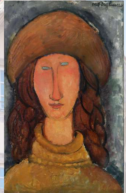
Amadeo Modigliani "Jeanne Hebuterne" 1918 Musée d'Art moderne, collections nationales Pierre et Denise Lévy